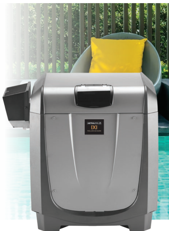
*VersaFlo is an optional accessory and needs to be purchased separately.